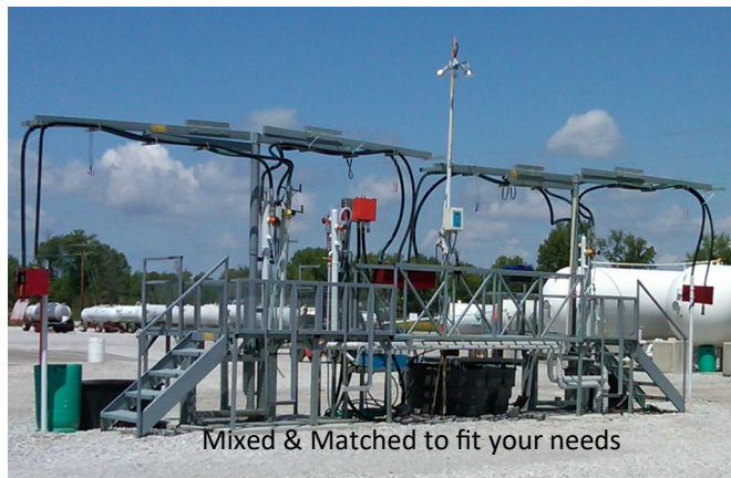
Mixed & Matched to fit your needs