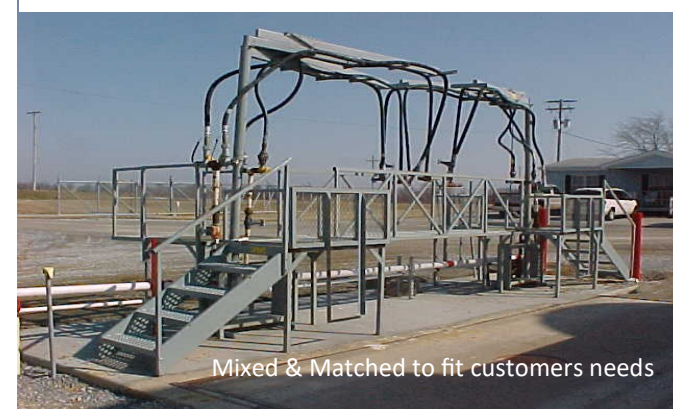
Mixed & Matched to fit customers needs